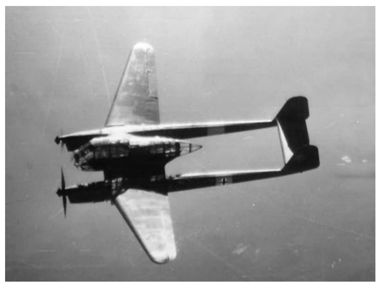
Focke Wulf Fw-189 Uhu