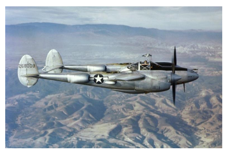
Lockheed P-38J Lightning